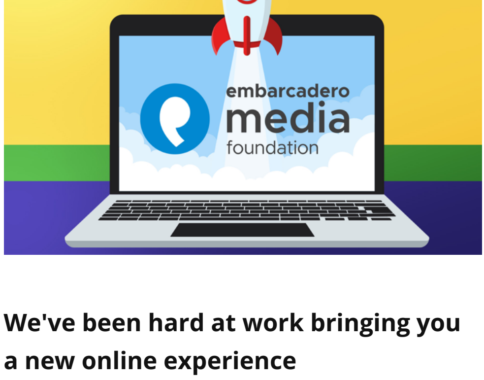
— And still powered by the same team of award-winning journalists! Support your